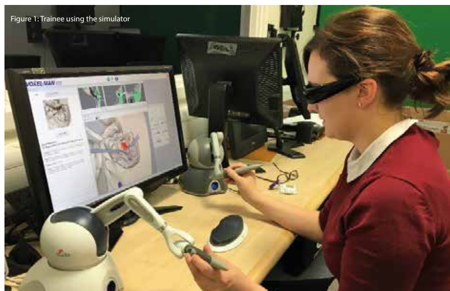
Figure 1: Trainee using the simulator

Within London North West Healthcare NHS Trust, we have access to a virtual reality temporal bone simulator, marketed by Voxel-Man, which is available for use by the trainees in the hospital during normal working